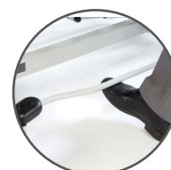
Foot Bar Switch