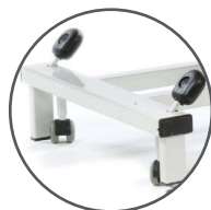
Linked Castor Base