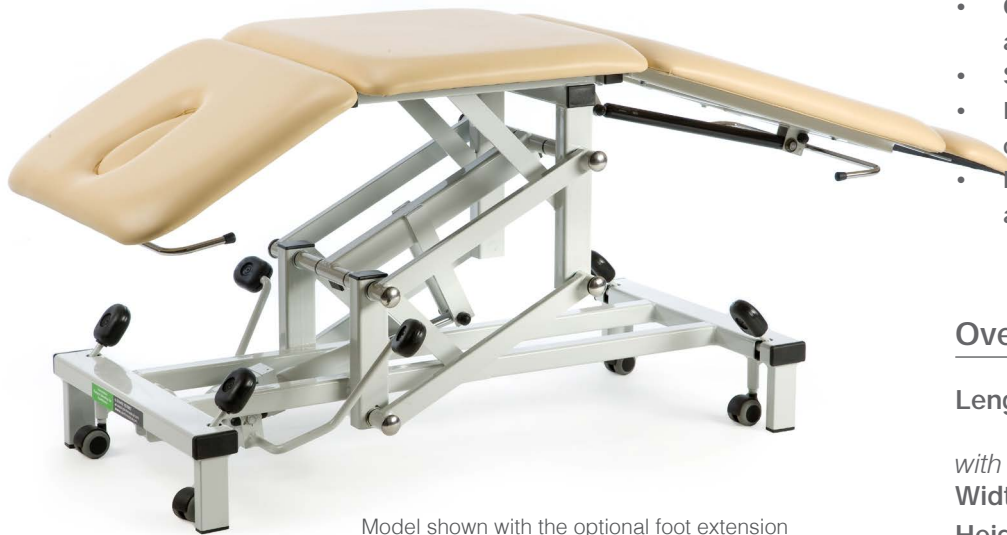
Model shown with the optional foot extension

A very strong and rigid couch designed for various manipulation and mobilisation procedures and mobilisation techniques. Suitable for constant and heavy usage, this couch will last for many years providing a trouble-free long life with minimal maintenance required. The short head section with breathing hole and plug is ideal for head and neck procedures.