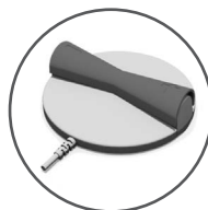
Foot Switch Operation