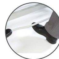
Foot Bar Switch