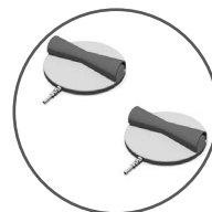
Dual Foot Switch Operation