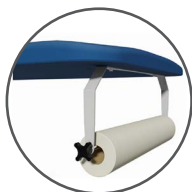
Paper Roll Holder