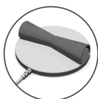
Foot Switch Operation