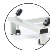
Linked Castor Base