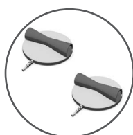
Dual Foot Switch Operation