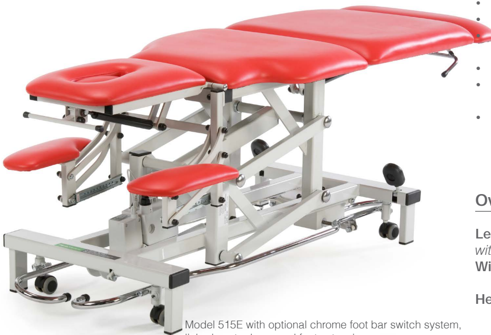
Model 515E with optional chrome foot bar switch system, linked castor base and foot extension.

Designed for rehabilitation techniques, this model features a head section with breathing hole and plug, and height adjustable armrests, providing additional comfort for the patient during prone head and neck procedures. The leg section can be extended for the taller patient and has angular adjustment between -25° and +85°. Electric models are supplied as standard with hand switch control, with options of single or dual footswitch operation, or the hands-free foot bar switch system.