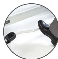
Foot Bar Switch