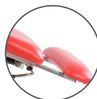
Foot Switch Extension