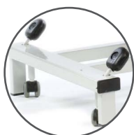
Linked Castor Base