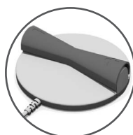
Foot Switch Operation