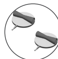
Dual Foot Switch Operation