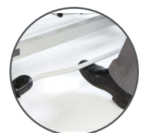
Foot Bar Switch