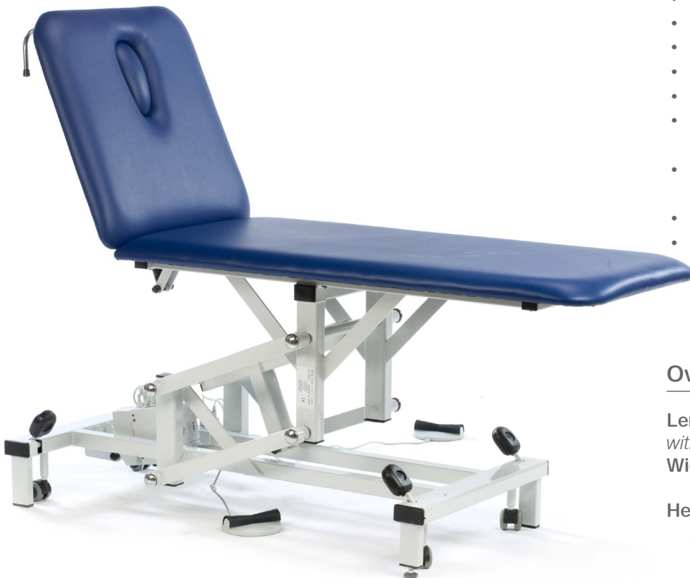
Model shown with the optional dual foot switch

An extremely strong and rigid 2 section couch designed for various examination and manipulation procedures and suitable for constant heavy use. This model features a full length head section with breathing hole and plug which is ideal for supporting a patient in a sitting position. The head section provides both positive and negative positioning.